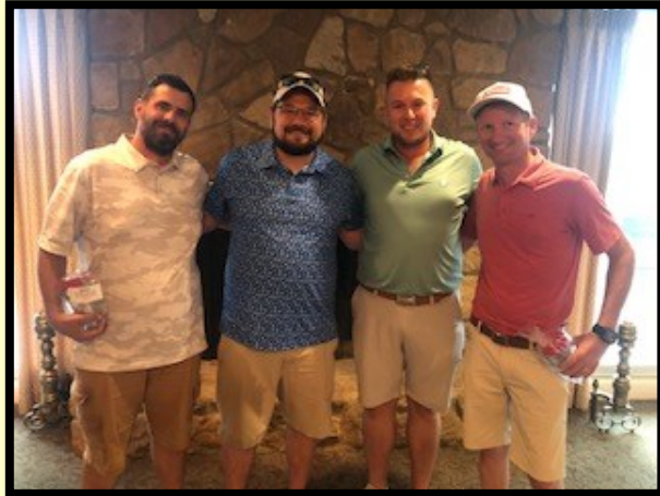
SECOND PLACE TEAM