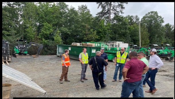
Sunbelt Rentals hosted Trench Safety Event in Charlotte

To receive NUCA Certificates & Hard Hat Sticker go to: www.NUCA.Com/tssd