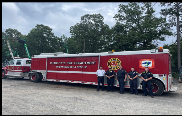
B.R.S. Inc. found a spot under a tree to keep cool while having safety talks!