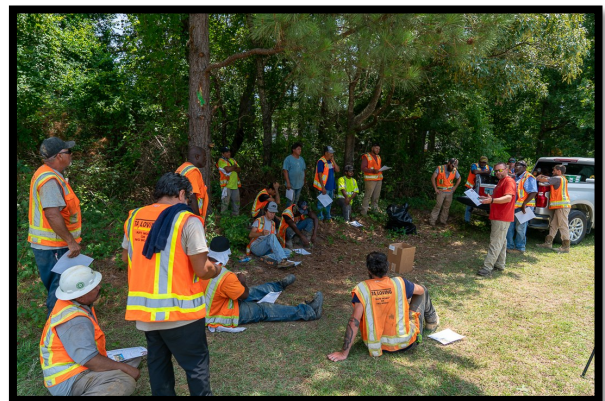
TA LOVING COMPANY