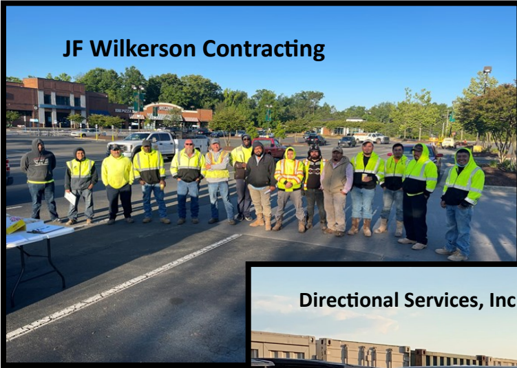
JF Wilkerson Contracting

THANKS TO EVERYONE THAT PARTICIPATED IN THE TRENCH SAFETY STAND DOWN.