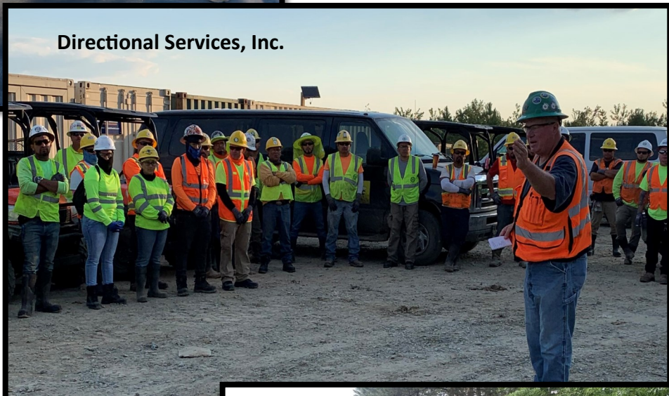
Directional Services, Inc.

BE SURE TO GO HERE TO GET CERTIFICATES AND HARD HAT STICKERS.