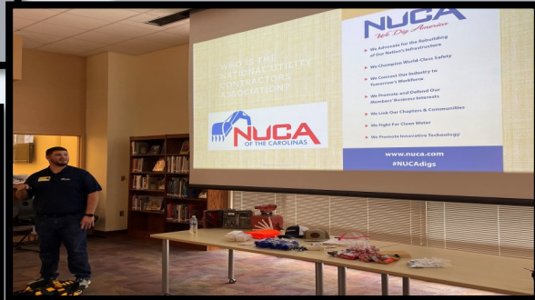
Young Leaders Career Center High School in Winston Salem where they spoke to High School Students about careers in the Construction Industry!