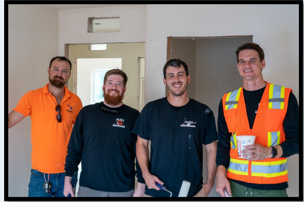
YOUNG LEADERS HABITAT FOR HUMANITY “BUILD DAY”