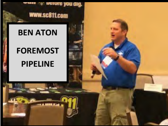
BEN ATON FOREMOST PIPELINE